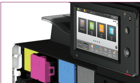
Automatic toner eject feature.

The toner cartridge automatically ejects *11 only when the toner has been fully exhausted, saving toner, minimising waste and supporting environmental goals.