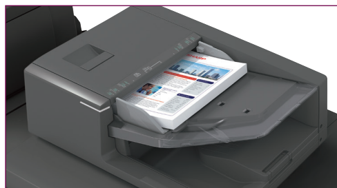
High speed scanning with double feed detection ensures smooth operation.

On selected models the high speed Duplex Single Pass Feeder (DSPF), offers double feed detection which pauses the operation when it detects skewed or multiple pages being fed in.