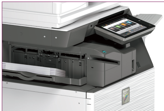
Release print jobs from the most convenient MFP.

And the Application Portal makes the MFP more adaptable by providing software updates and cloud connector apps that enable agile updating.