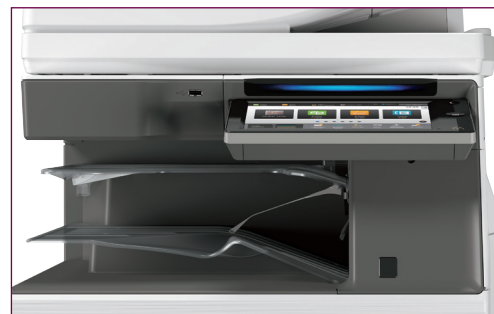
Distinct light patterns indicate specific MFP functions.

Check the status of the MFP with just a quick glance at the lights of the Status Communication Bar (or Status LEDs on the BP-30C25).