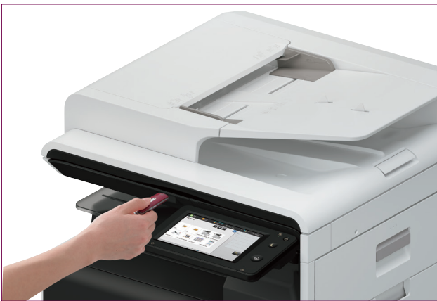
Insert your USB stick and start printing.

No one enjoys having to remember additional usernames and passwords. Instead, Single Sign-On (SSO) is a smarter way to access public cloud services. It lets you securely print and store information in the cloud* 1 using Google Drive™, OneDrive® for Business, SharePoint® Online, Box and Dropbox with just one simple log in from the control panel. There's also an integrated Gmail connector for scanning to email and Exchange Online (MS 365 email).